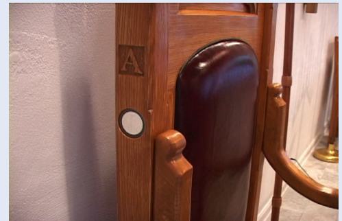
Side detail, Alpha and silver dollar