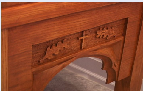
Side detail, Bishop's Chair