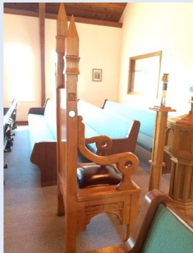
Side view, Bishop's Chair