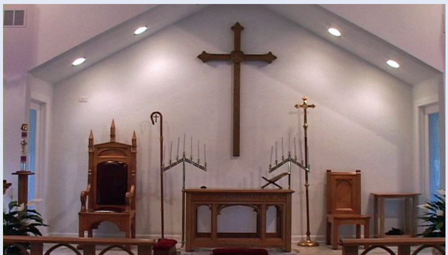
Bishop's chair in Trinity's chancel